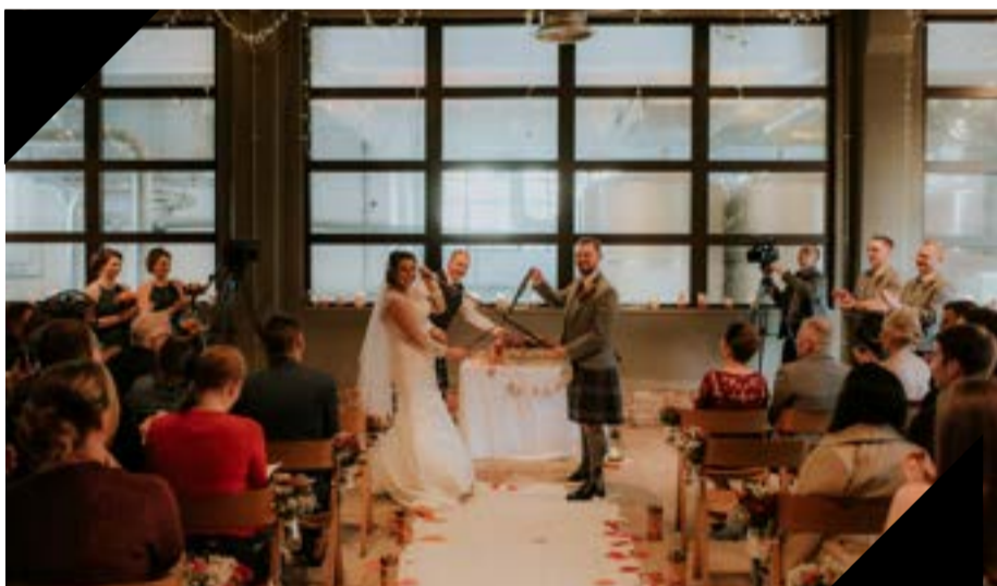
COURTYARD ROOM HIRE

Available for up to 60 day guests and up to 90 guests for your evening reception.