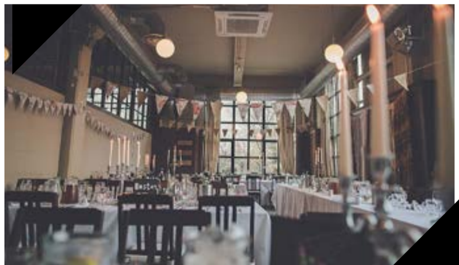
HOP ROOM HIRE

Available for parties of 90 or more guests.