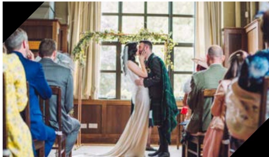
THE HOP ROOM

Available for a minimum of 65 day guests and up to 200 guests for your evening reception.