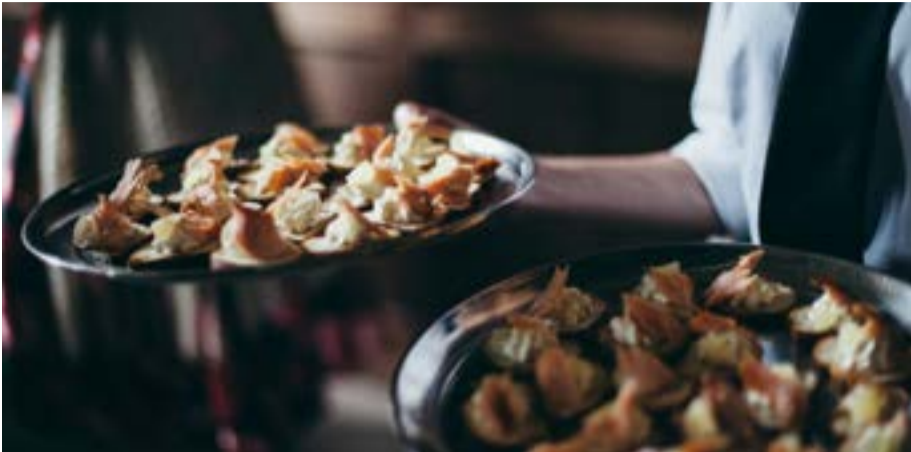
DRINKS RECEPTION CANAPES £8pp choose 3 items

Curried Crab Mayo on rye toasts Black Forrest Ham with smoked Cheese Haggis Bon-Bons with mustard mayo Smoked Aubergine & Tomato Bruschetta Honey Mustard Chicken Lollipops Currywurst & Pretzel Skewers