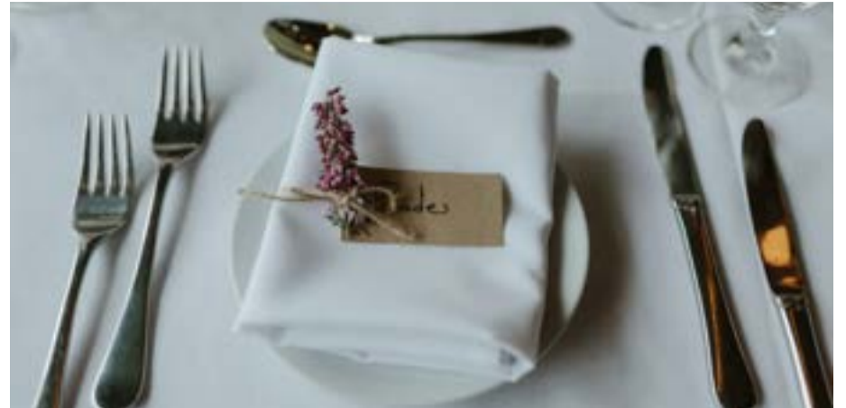
EVENING ROLLS £7pp

Curried Crab Mayo on rye toasts Black Forrest Ham with smoked Cheese Haggis Bon-Bons with mustard mayo Smoked Aubergine & Tomato Bruschetta Honey Mustard Chicken Lollipops Currywurst & Pretzel Skewers