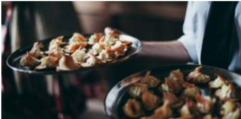
DRINKS RECEPTION CANAPES £8pp choose 3 items

Salmon & Cream Cheese Bellinis with dill Houmous & Apricot Oatcakes Curried Crab Mayo on rye toasts Haggis Bon-Bons with mustard mayo Smoked Aubergine & Tomato Bruschetta Honey Mustard Chicken Lollipops Currywurst & Pretzel Skewers