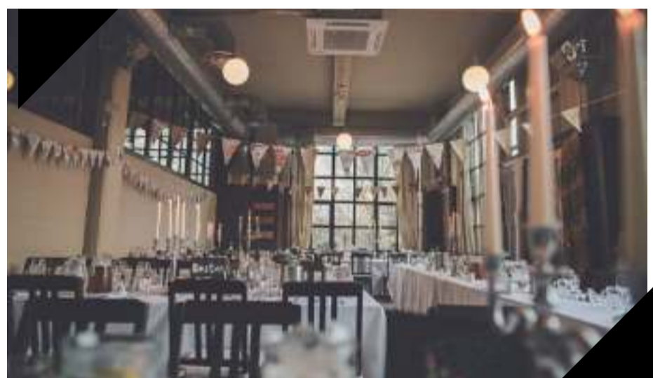
HOP ROOM HIRE

Available for parties of 90 or more guests.