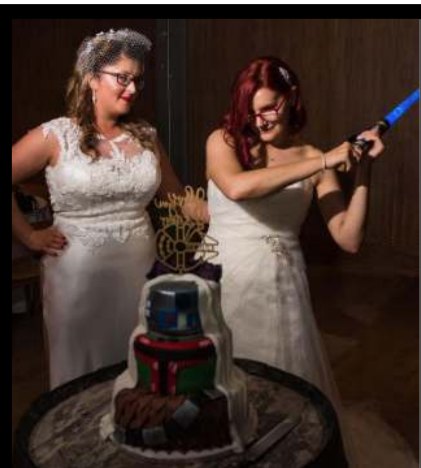
EVENING SNACKS £8pp choose 3 items

Gluten-free options available upon request.