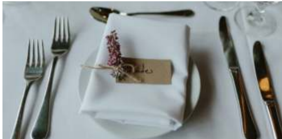
EVENING ROLLS £7pp

Salmon & Cream Cheese Bellinis with dill Houmous & Apricot Oatcakes Curried Crab Mayo on rye toasts Haggis Bon-Bons with mustard mayo Smoked Aubergine & Tomato Bruschetta Honey Mustard Chicken Lollipops Currywurst & Pretzel Skewers