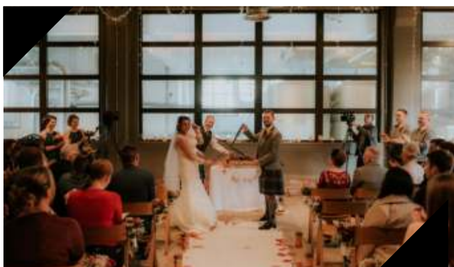
COURTYARD ROOM HIRE

Available for up to 60 day guests and up to 90 guests for your evening reception.