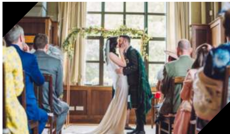
THE HOP ROOM

Available for a minimum of 65 day guests and up to 200 guests for your evening reception.